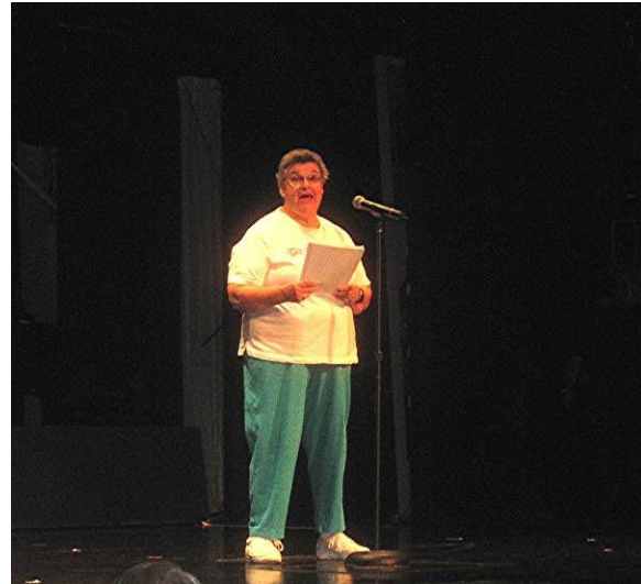
touched a lot of points that got laughs.

The first act was a repeat performance brought back by popular demand. It was Cathy, delivering a humorous contrived prayer from a Grand Cruise person on the last day of the cruise. For example, it asked for help in surviving without stewards and that you have at least one shirt you can still button over your well fed stomach for the trip home. She